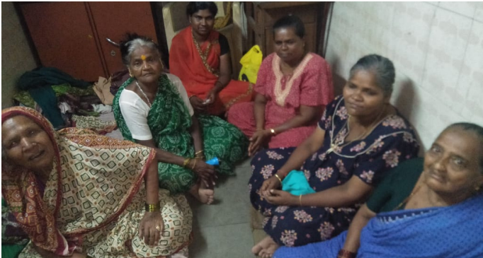
AAJI'S COLLECTING FOOD PACKS

Aajis have been meeting in different homes as they have no regular place to meet. They are supported with monthly provisions Glory School is gearing up for various activities like sports, class photo, annual day etc. And plan to start class 4 n 5 this year.