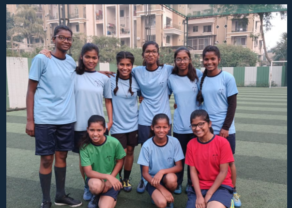
SHINING LIGHT SCHOOL- GIRLS TEAM