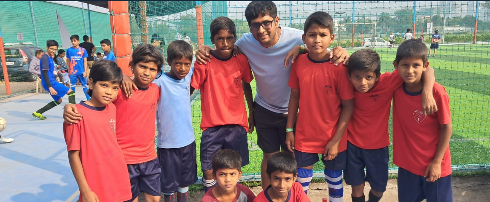
SHINING LIGHT ACADEMY BOYS (SENIORS). UNDER 19 TOURNAMENT- PUNE