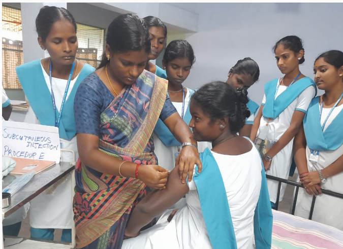
JMHA NURSING INSTITUTE- STUDENTS PRACTICAL CLASSES